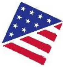
AMERICAN CENTER BAKU