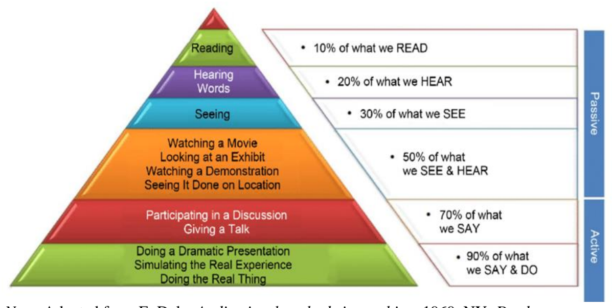
Figure 1. The Cone of Learning by Edgar Dale

Note. Adapted from E. Dale, Audio visual methods in teaching, 1969, NY: Dryden press.