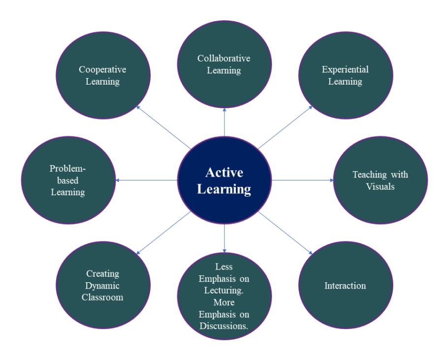
Figure 2. Students' widely shared perceptions on Active Learning.

During the interview when the faculty members were requested to define active learning, they linked it with different sections of the modern pedagogy (Figure 3).