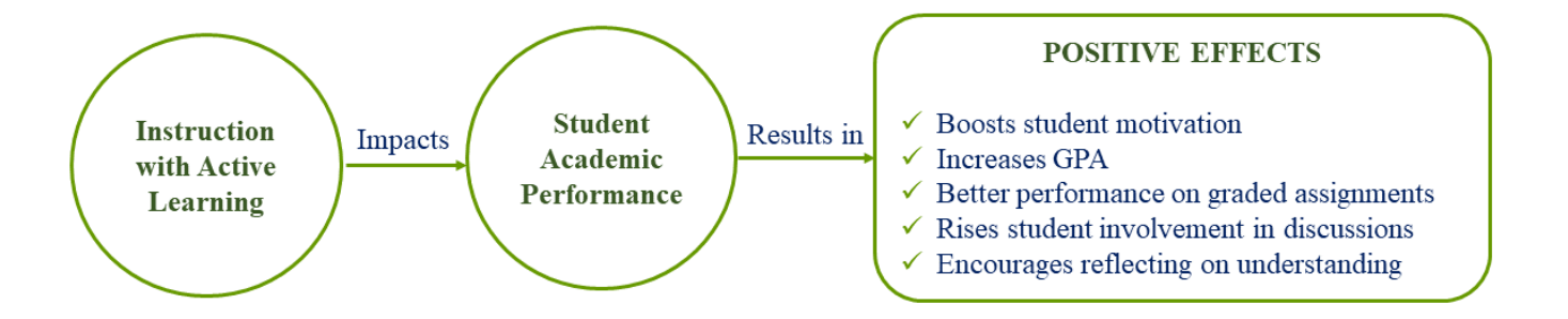
Figure 5. Impact of Active Learning on Students' Academic Performance.

account interview, survey and document review data, analysis reveals that active learning has positive effects on student academic performance (Figure 5).